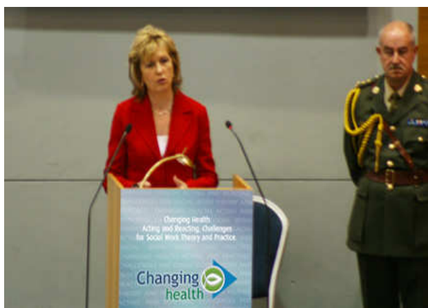
Mary McAleese President of Ireland

This triennial event with the theme 'Changing Health: Acting and Reacting, Challenges for social work theory and practice' attracted over 700 abstracts from around the world. It provided a broad and rich selection of social work topics in health and mental health delivered by social workers across many and varied fields and cultures aiming to enhance and improve their work. The event sought to connect academics and practitioners together in order to stimulate ideas and work on solutions, and ultimately to raise standards in social work for the greater good of all those in need of social work interventions.